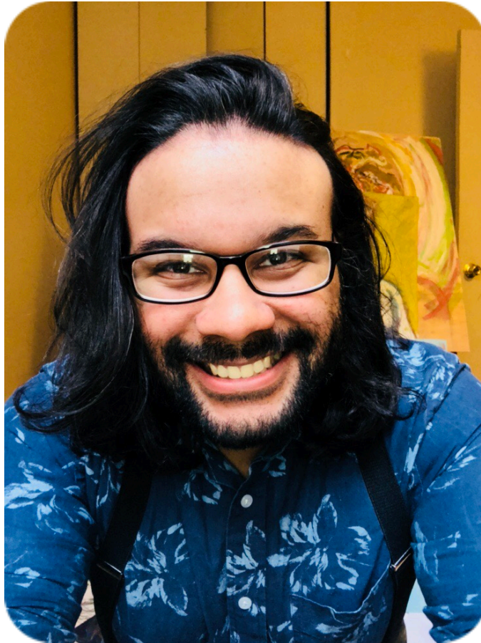
Image Description: A smiling Puerto Rican male with light tan complexion, chin-length black hair with beard and mustache. He is wearing black rimmed glasses, denim blue collared shirt with light white floral imprints and black suspenders. He is sitting in front of a mustard yellow colored wall. Behind his left shoulder is a painting.

Deaf world and Hearing world - I found it challenging but over time, I realized I had to depend on myself. Both worlds gave me challenges but they also gave me an insight into two cultures. Both cultures gave me a way to express myself through art, not American Sign Language. The reason for this is it is difficult for me to express myself through sign language when I am a "mentally unstable" person. When I say I am "mentally unstable," I mean in the way I see words when someone is talking or signing. The words I see are painted in the background and I can pick up on people's auras. It is challenging to explain the way I see people and the world but through art, it is easy. Interpreter to be a part of a sign language interpreted performance for "El Hombre de la Mancha." We were all very excited. turn custard onto a platter.