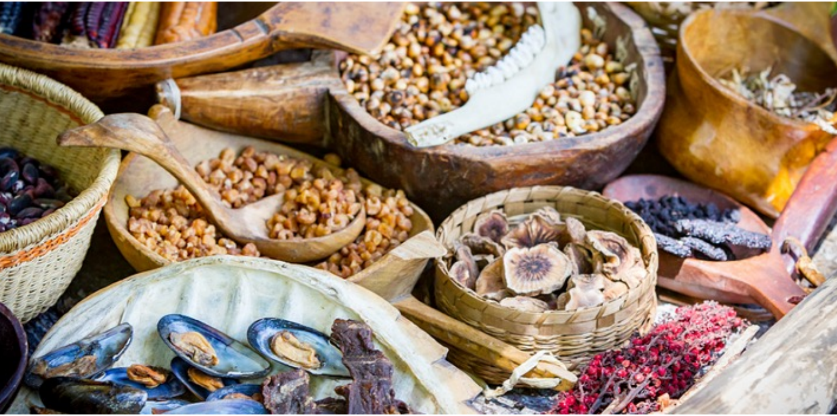
Image Description: A spread of food in various woven or wooden bowls. From bottom left, clockwise: mussels, dried beans, dried corn stalks, dried, golden corn kernels, another larger bowl of golden brown corn kernels, dried herbs and stalks of dried flowers.